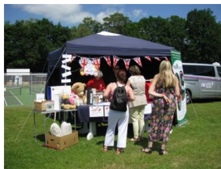
HSBRDA Tombola and Raffle Stall

Our stall was of course manned by a team of volunteers for the whole of Saturday and Sunday – and thanks to everyone who took a turn and contributed to the success of our raffle and tombola. The takings at the stall were £738.50 over the two days and with the money received from the