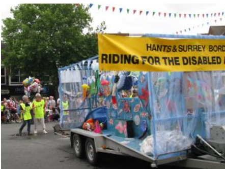
Children's drawings on the float