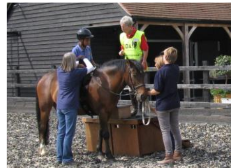
Rolo at the Mounting Block

Introducing a new addition to our pony team—Rolo has quickly learnt the ropes and guesses what the children want him to do before they ask!