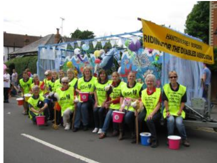
Side-walkers and buckets at the ready—our RDA float ready for the procession

“Our volunteers give their time freely—their enthusiasm is crucial to success with the children”