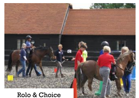
Rolo & Choice

“Pony-riding is a great way for a disabled child to have their physiotherapy—it holds their interest and is great fun”