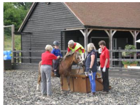
Choice at the Mounting Block