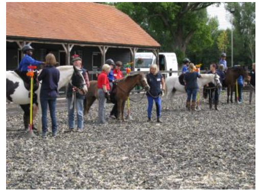
Tuesday Lesson at Four Seasons June 2017