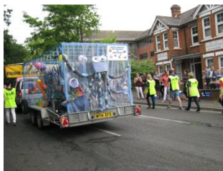
Olly the Octopus in the procession

The pupils of both of the schools that we work with provided lots of artwork to dress the float – all in the theme of “under the sea” and we were delighted with the fantastic results, which included a giant blue octopus, many colourful jellyfish and fish of all shapes and sizes. Our thanks to the staff of Badshot Lea and Henry Tyndale Schools for entering so enthusiastically into the spirit of the event.