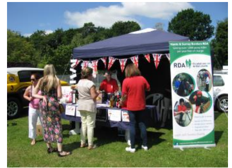
RDA Stall in Calthorpe Park

Building up to the carnival we had to find ways to source raffle prizes and bottles, jars and items for our tombola stall in Calthorpe Park.