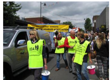
The collecting bucket brigade

Once again our reliable volunteers collected and donated bottles, jars and raffle prizes. Lesley wrote innumerable letters to local companies asking for prizes and many thanks go to all the local businesses that donated vouchers